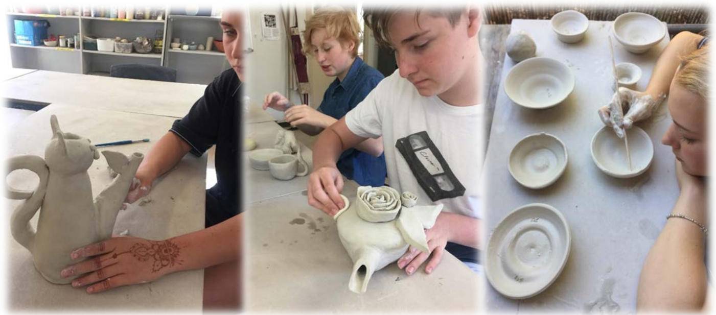
Creating the ultimate drink and dining ware.

The Class 9s have been busy learning to create functional mugs and bowls, from pinch pots, textured slab mugs and even budding up on the pottery wheels for a challenging bit of fun. We finished with a little picnic celebrating the completion of all of the amazing dining and drinking creations.