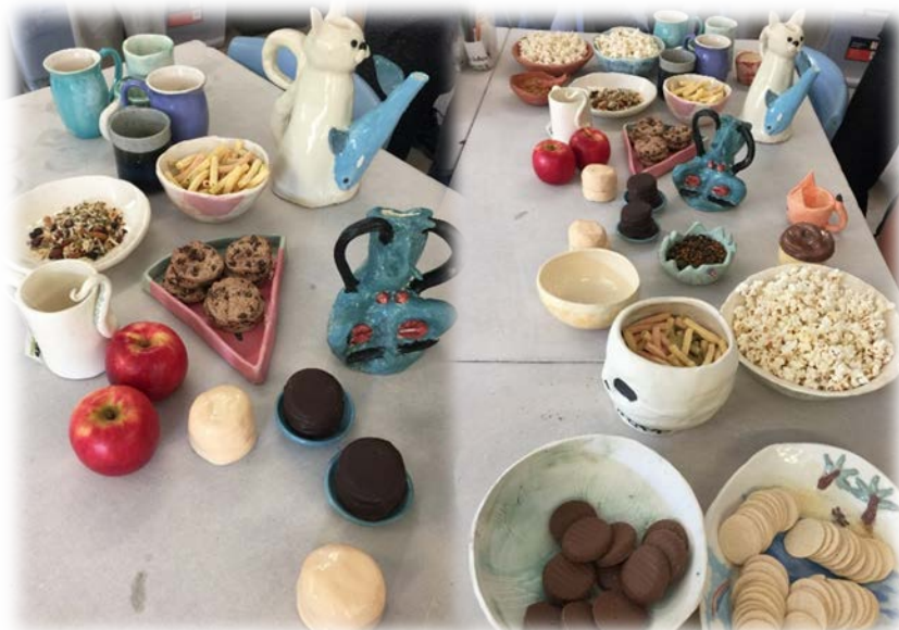
Enjoying testing out the creations.