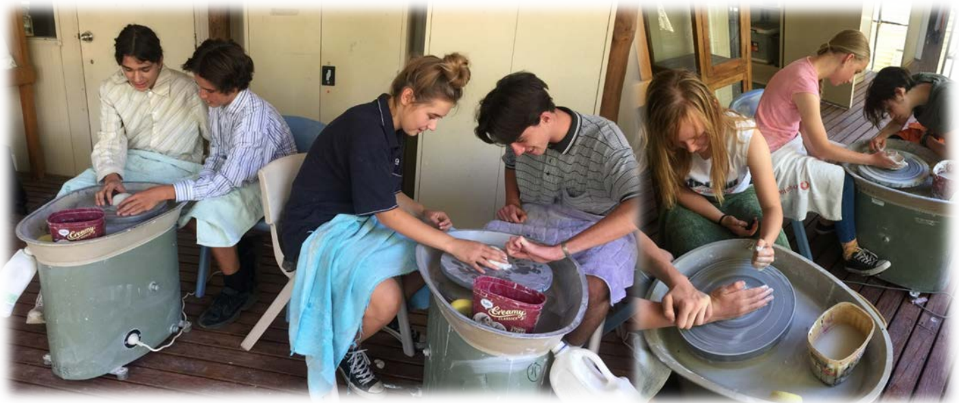
The one handed challenge.